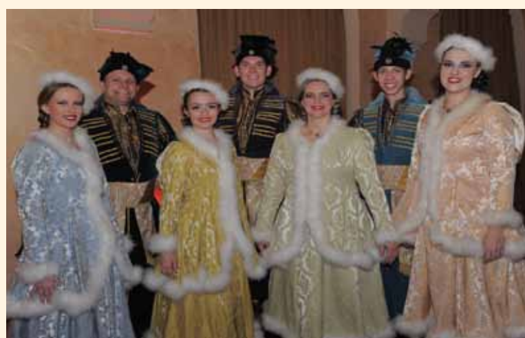
The Polish American Folk Dance Company