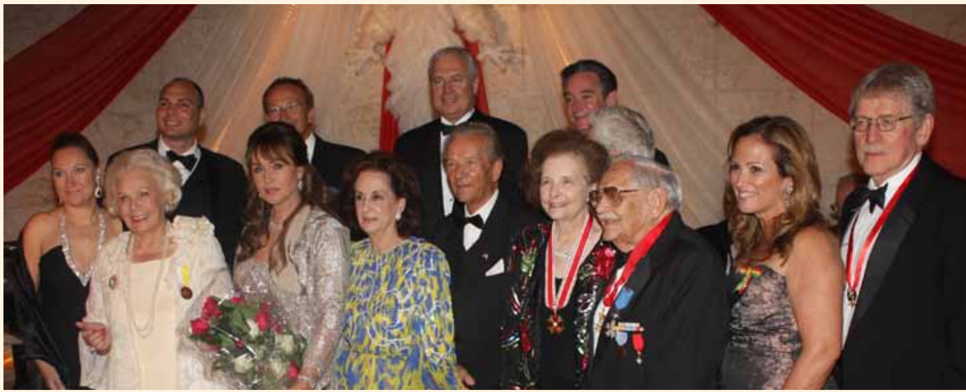
Board of Directors; The American Institute of Polish Culture: