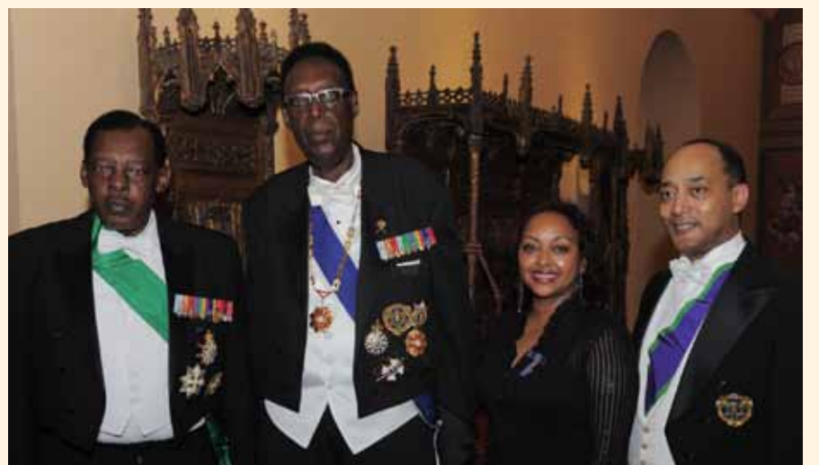
Chancellor Boniface Benzinge, H.R.H. King Kigeli V of Rwanda, Lady Saba, H.I.H. Ermias Sahle-Sellase Haile-Selassie, Prince of Ethiopia