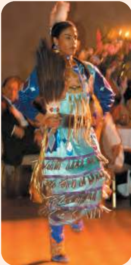
Dancer from the Native American dance group Kehewin family Cree Nation from Canada