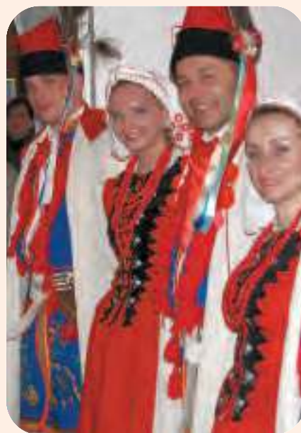
Dancers from the Polish-American Folk Dance Company from New York