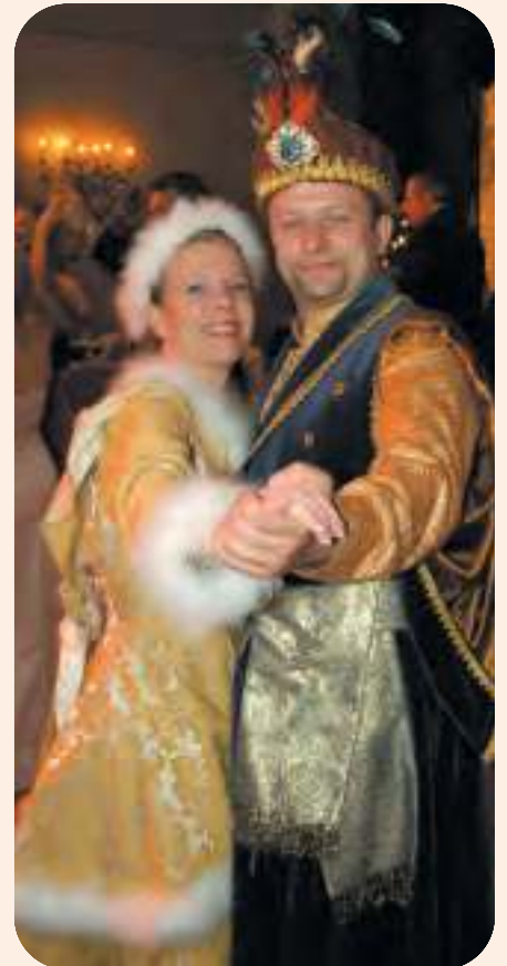
Dancers from the Polish American Folk Dance Company from New York