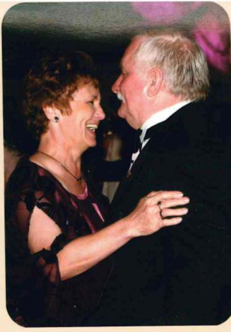
Mrs. Danuta Walesa, President Lech Walesa