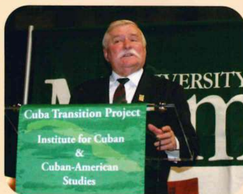
President Lech Walesa