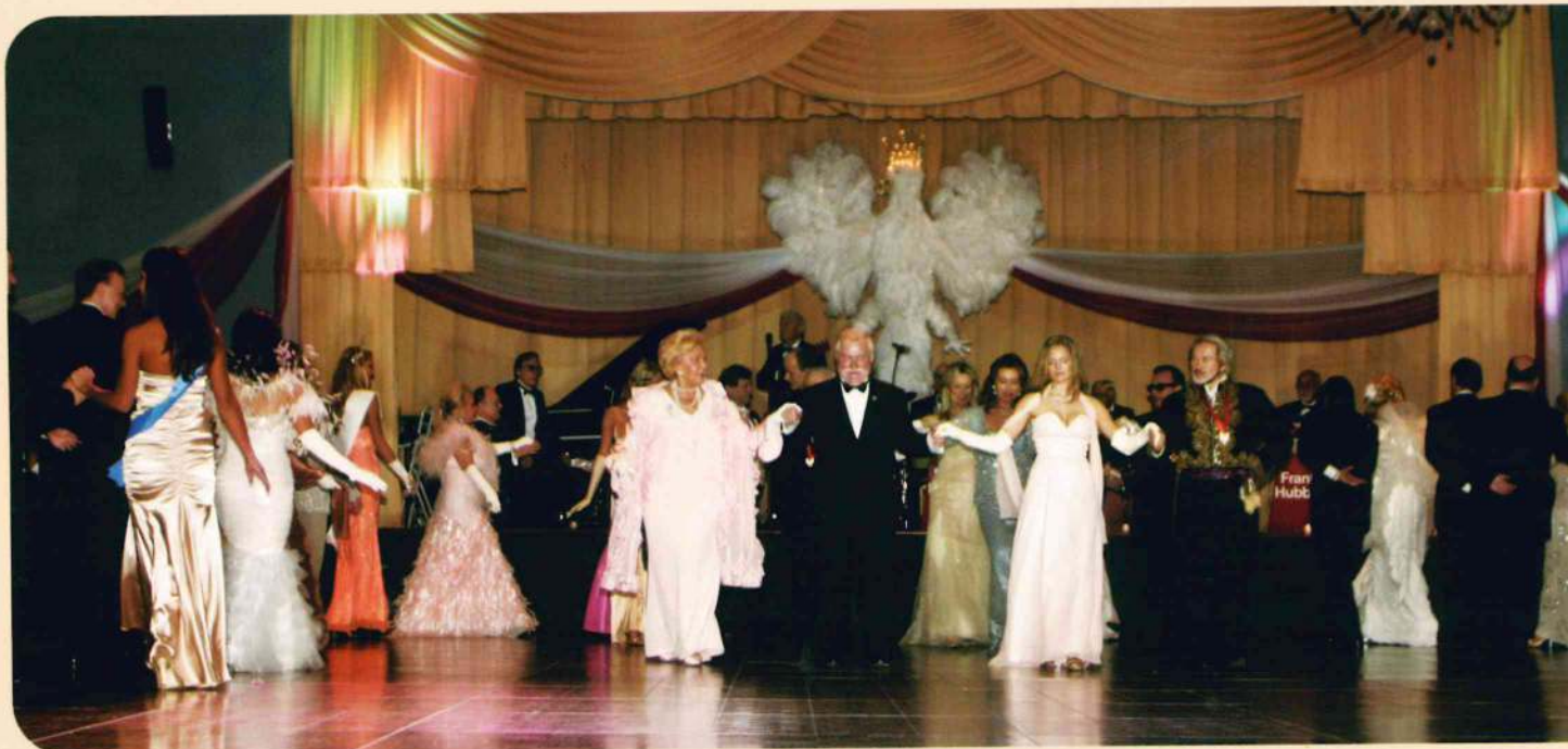
Opening Polonaise Dance