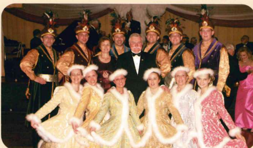
President and Mrs. Lech and Danuta Walesa with the Polish American Folk Dance Company