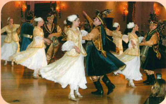
The Polish American Folk Dance Company