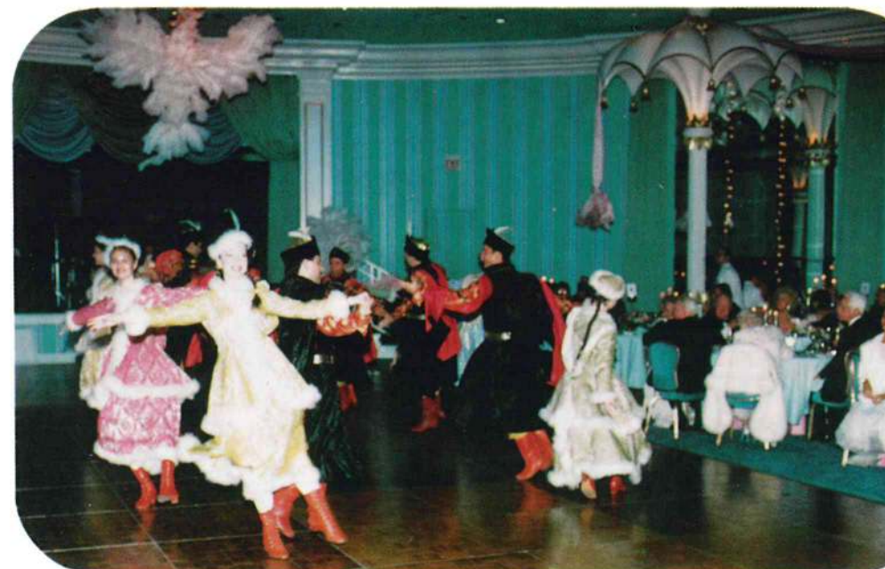
Polish American Dance Group of New York