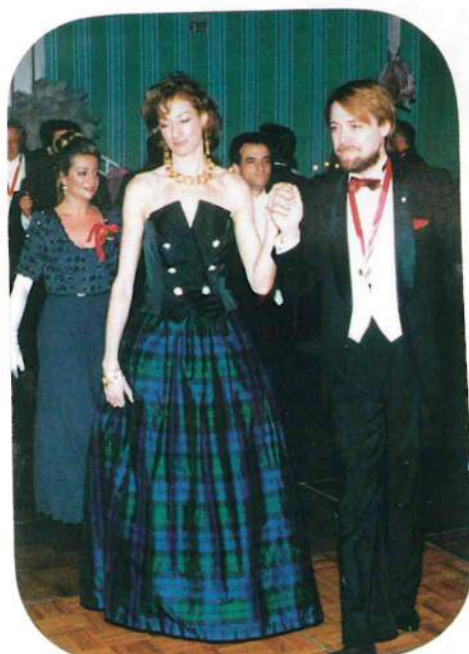
Count and Countess Giordano d'Altavilla.