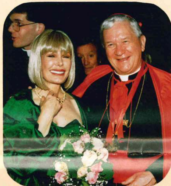
Ms. Loretta Swit and Adam Cardinal Maida.