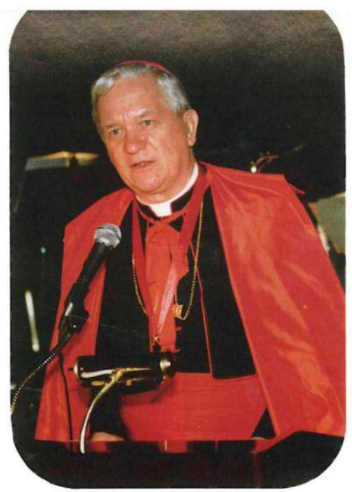
Adam Cardinal Maida.

In his acceptance remarks His Eminence mentioned the importance of recognizing the Pope John Paul II as the greatest Pope in history. He said: