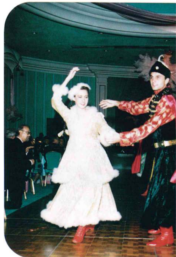
Polish American Dance Group