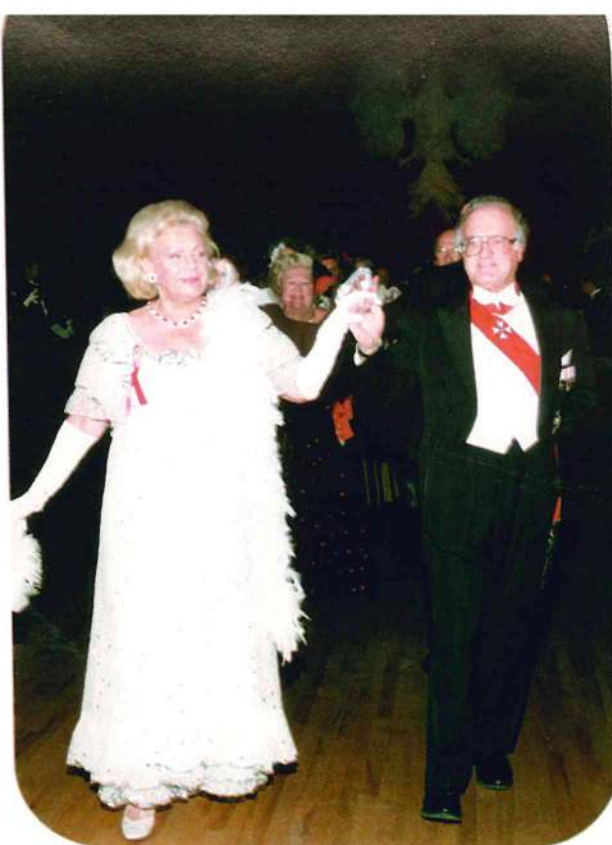
Lady Blanka Rosenstiel and Senator Stanley Haidasz