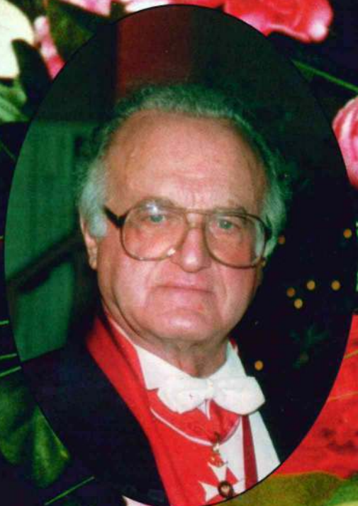
Senator Stanley Haidasz