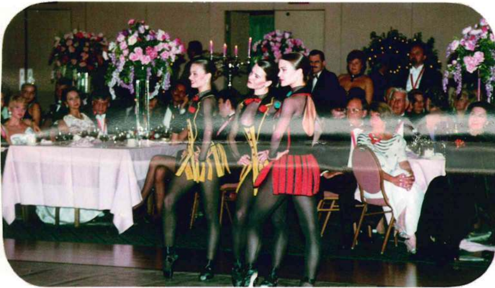
Miami City Ballet