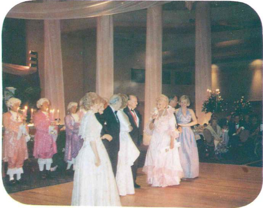
Presentation of the honored guests