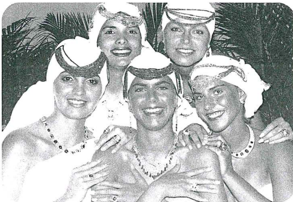
An elegant jewelry show enlivened the cocktail party