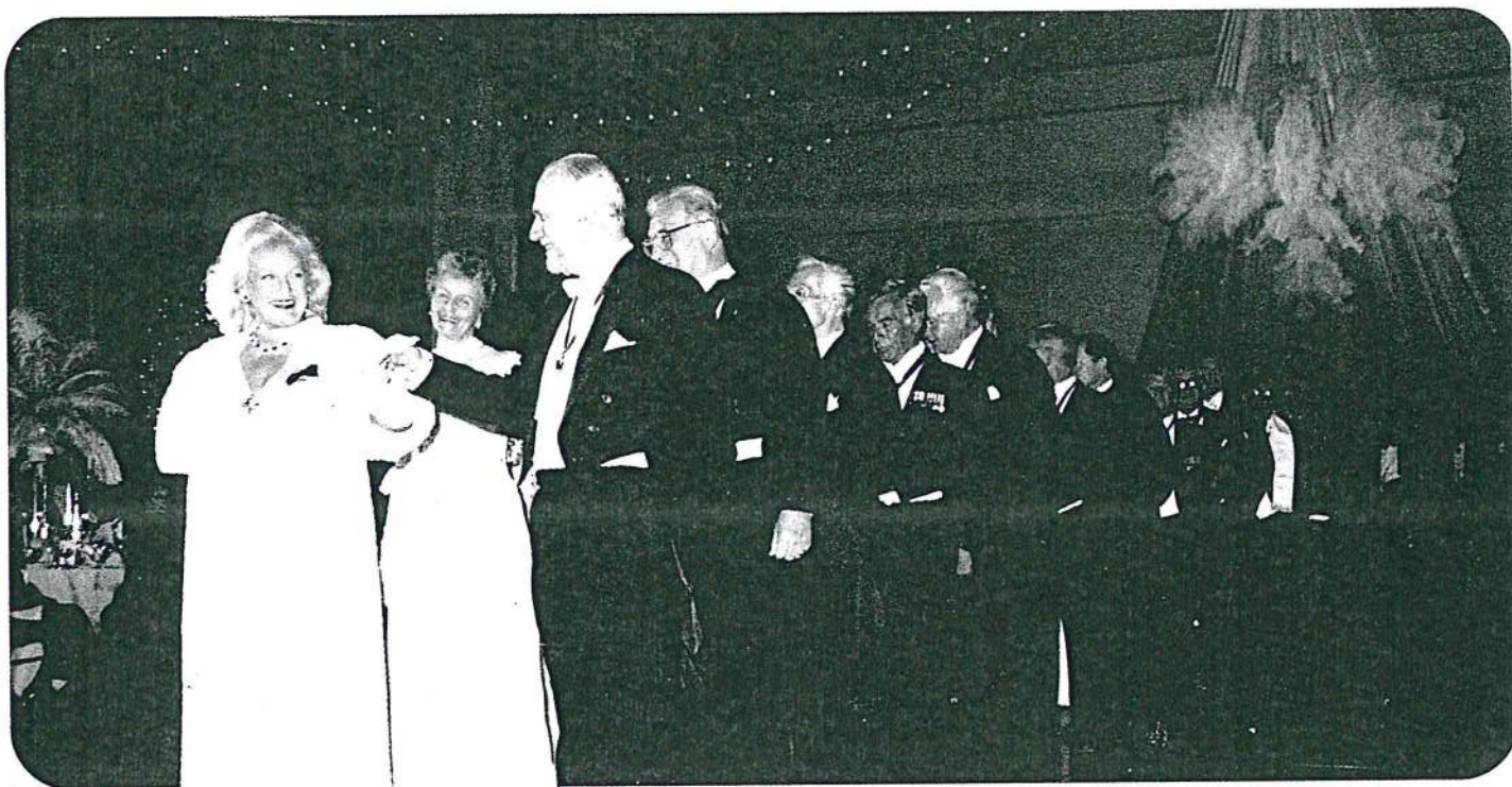
Like the royal courts of centuries past, the elegant Polonaise procession begins....