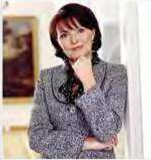
Jolanta Kwasniewska born 1955

The former Polish First Lady (1995-2005) grew up in Gdansk, where she graduated with a law degree from the University of Gdansk. There she met Aleksander Kwac̄niewski and they married in 1979. Later she established a real estate agency where she worked until her husband became the President of the Republic of Poland.