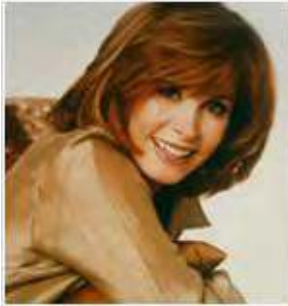
Stefanie Powers born 1942

for outstanding achievements in the performing arts