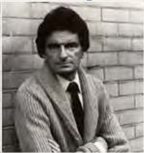
Jerzy Kosinski 1933-1991

Jerzy Kosinski was a Polish novelist of Jewish origin, who survived World War II under a false identity in a Catholic family in eastern Poland. After the war, Kosinski was reunited with his parents and earned degrees in history and political science from the University of Lodz. In 1957 he immigrated to the United States.