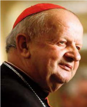
Cardinal Stanislaw Dziwisz

for his extraordinary vision and long service as Secretary to Pope John Paul II