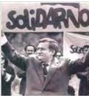
Lech Walesa, born 1943