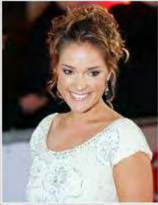
Alicja Bachleda – Curus

Alicja Bachleda - Curus is a Polish actress and singer, born in Tampico, Mexico on May 12th, 1983. Her debut was at the tender age of 6 when she performed at a children's music festival in her home country, Poland. Awarded several times for her acting as well as her singing, Bachleda-Curus talents have taken her around the world, and she has represented Poland during International Film Festivals in Croatia, Germany and Italy.