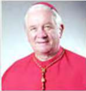
Adam Joseph Cardinal Maida, born 1930

His Eminence Adam Cardinal Maida for his extraordinary vision, leadership and efforts to establish the Pope John Paul II Cultural Center in Washington, D.C.