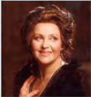
Teresa Zylis- Gara born 1935

A lyrical soprano and one of the most accomplished Polish opera singers of the 20th century, Ms. Zylis-Gara was born in Vilnius and studied in Lodz. In 1956 she made her debut at the Krakow Opera as the heroine of Stanislaw Moniuszko's Halka . Her next success at a radio competition in Munich in 1960 allowed her to perform on German stages in Oberhausen, Dortmund and Düsseldorf and later at the renowned English festival at Glyndebourne. Her real breakthrough came in 1966 in Paris, where she performed the part of Donna Elvira in Mozart's Don Juan . Later she was invited to perform in Salzburg with the famous conductor Herbert von Karajan at London's Covent Garden as Violetta in Verdi's La Traviata , then at the San Francisco opera and eventually at the Metropolitan Opera in New York. Zylis-Gara has also worked with the opera theatres in Berlin, Hamburg and Munich, as well as with Milan's La Scala and Vienna's Staatsoper.