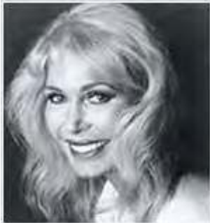
Loretta Swit born 1937