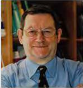
Norman Davies born 1939

A British historian renowned for his publications on the history of Poland, Norman Davies studied history at Magdalen College, Oxford, and after stays in France and Italy went to Krakow, where he received his Ph.D. from the Jagiellonian University doing research on the Polish-Soviet war. Later he taught Polish history at the School of Slavonic and East European Studies at the University of London, where he was a professor until 1996. Now Professor Davies is Supernumerary Fellow at Wolfson College, Oxford.