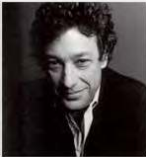
Count Adam Zamoyski born 1949

A member of the old Polish noble family that left the country during World War II and stayed in exile during the decades of Communist regime, Adam Zamoyski was born in New York and brought up in England, where he graduated from The Queen's College in Oxford. In the 1960s he began to visit Poland, drawn by his passion for history and interest in his heritage. In 1979 he published the award winning biography of Frederick Chopin, which has become an important reference for scholars. He soon wrote a biography of the pianist and statesman Ignacy Jan Paderewski, followed by an account of the Polish-Bolshevik war of 1920, and then The Polish Way: A Thousand-year History of the Poles and Their Culture , which stayed on the British best-seller lists for several weeks.