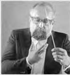
Krzysztof Penderecki born 1933

Krzysztof Penderecki is one of the most esteemed and widely discussed classical composers of our time. His nearly one hundred compositions include four operas, eight symphonies, choral and chamber works and concertos.