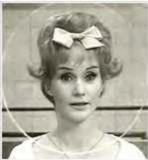
Barbara Krafftowna born 1928

Barbara Krafftowna is a beloved Polish film, stage and television actress. Born in Warsaw and educated at the prestigious Old Theater in Krakow, after stage debut in 1946, she performed mostly at the Dramatic Theater in Warsaw. Krafftowna's melodic voice made her famous through television performances in the Two Elderly Gentlemen's Show in 1960s. Her witty characters and songs are still popular among generations of the show's devoted fans.