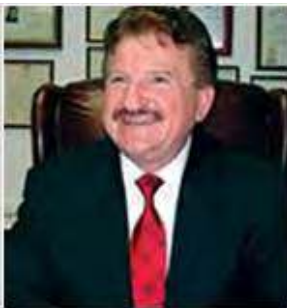
Stanislaw Burzynski born 1943

Stanislaw Burzynski is known for the discovery of a promising and controversial cancer cure: antineoplastons. His experimental treatments evoke skepticism, but Dr. Burzynski used antineoplastons for 30 years in the treatment of more than 3,000 patients. Many survivors claim that he saved their lives.