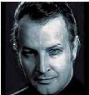
Wieslaw Ochman born 1937

An internationally famous Warsaw-born lyrical tenor. Wieslaw Ochman debuted in 1960 at the Silesian Opera in Bytom and in the following years performed at the Krakow Opera and the Grand Theatre in Warsaw. His international career began in 1967 in Berlin, followed by opera festivals in Salzburg and Glyndebourne and engagements in Munich, Hamburg, Paris, Chicago and San Francisco. In 1975 he debuted at New York's Metropolitan Opera in Verdi's The Sicilian Vespers . Soon he formed a permanent collaboration with the Hamburg Staatsoper and the Berlin Staatsoper.