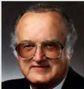
Honorable Stanley Haidasz M.D., born 1923

The Honorable Stanley Haidasz for efforts on behalf of humanity