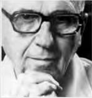
James Michener 1907-1997

James Michener was an American author of more than 40 historical novels. His first book, Tales of the South Pacific , won the Pulitzer Prize for Fiction in 1948. In 1983 he published Poland – the result of nearly a dozen trips to the country and thorough research of its history and customs. The novel spans eight centuries and describes the destinies of three Polish families.