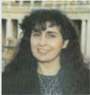
Eleni Tzoka born 1956

One of the most popular Polish female singers, Eleni Tzoka was born in Bielawa, Poland, to a Greek family with rich artistic traditions. Eleni had been singing since childhood, and in high school debuted with her first band Ballada. In 1975 she started to sing professionally with the band Prometheus and recorded her first record titled On the Sunny Side of Life .