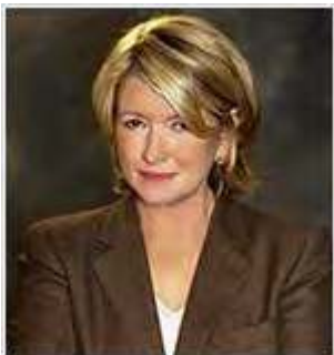
Martha Stewart born 1941

Martha Stewart - media tycoon, "domestic diva," business magnate and, during the early 2000's, a subject of an insider trading controversy and a lengthy litigation. The story was hard to miss.