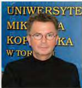
Aleksander Wolszczan born 1946

for outstanding achievements in the field of astrophysics