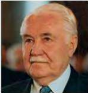
Ryszard Kaczorowski 1919 -2010

Ryszard Kaczorowski was born in Białystok in eastern Poland. When the Soviet Union invaded Poland on September 17, 1939, shortly after the outbreak of World War II, he immediately joined the underground movement. He also clandestinely created a scouting movement in Poland against the Soviet mandates. He was arrested by the Soviet NKWD and sentenced to death, which was later commuted to 10 years in a Kolyma Gulag. After an amnesty in 1941 President Kaczorowski joined the Polish forces forming under General Anders and took part in the 1944/1945 Italian Campaign, including the famous siege of Monte Cassino. Unable to return to Soviet-occupied Poland at the end of the war, he chose exile in Britain, where he later became the head of the Polish Scouting Union (ZHP) in Exile.