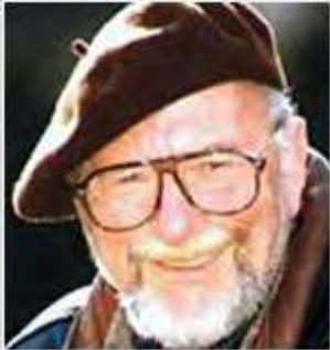
Jerzy Hoffman born 1932

Jerzy Hoffman is an acclaimed director and screenwriter best known for his adaptations of Polish literary classics. Although he was born in Krakow, Hoffman grew up in Siberia where his family was displaced during World War II. After the war he returned to Poland to study at the State Film Institute in Moscow, from which he graduated in 1955.